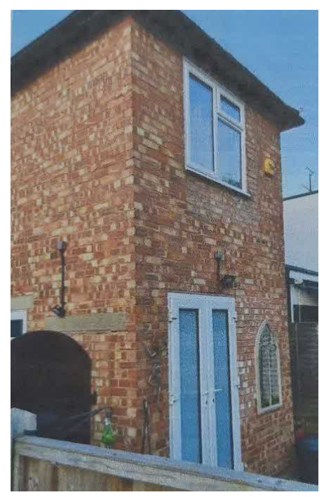
Photo 1 sent to planning officer on 27<sup>th</sup> April clearly showing non glazed door.

Photo 2 taken from applicants Surveyors report dated 11<sup>th</sup> May showing an old photograph has been used to give the impression the door is glazed.